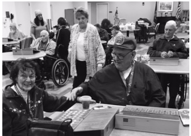
FEB 19th: ELKS LODGE 720 VISIT TO MANCHESTER VAMC